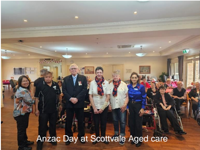
Anzac Day at Scottvale Aged care