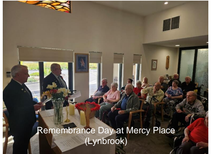
Remembrance Day at Mercy Place (Lynbrook)