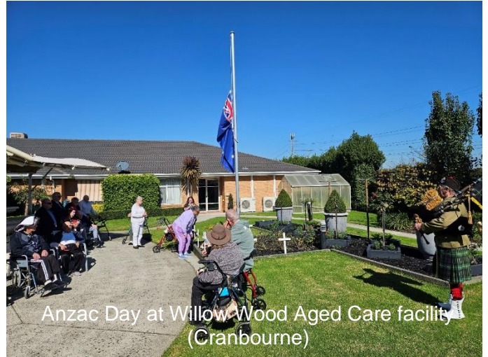
Anzac Day at Willow Wood Aged Care facility (Cranbourne)