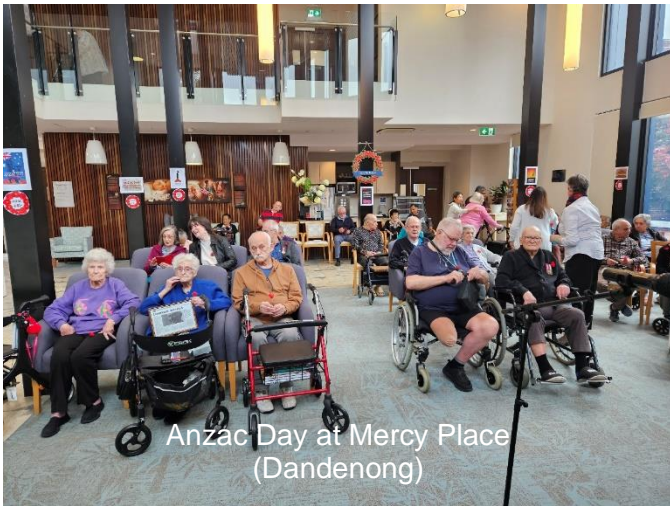
Anzac Day at Mercy Place (Dandenong)